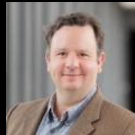
Brian Claypool Governor-at-Large 2019