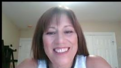
USA - NEW YORK REGION GOVERNOR Rosemarie Lockwood, Belden