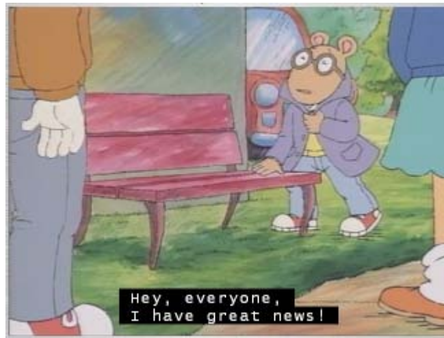
Figure 1 – Caption example

'Arthur' Image courtesy WGBH Boston, Image and text ©1996, 2010 WGBH Educational Foundation" Used with permission